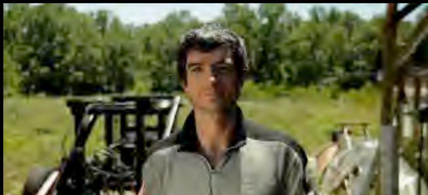
MARCIN JAKUBOWSKI: GLOBAL VILLAGE CONSTRUCTION SET